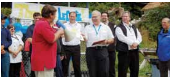
AMHS Appreciation Day honoring the LeConte crew