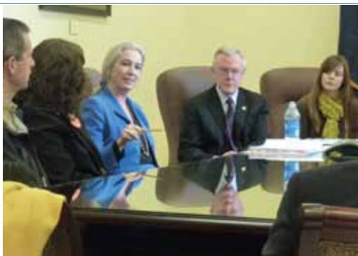
Meeting with owners of Alaskan Tourism Businesses