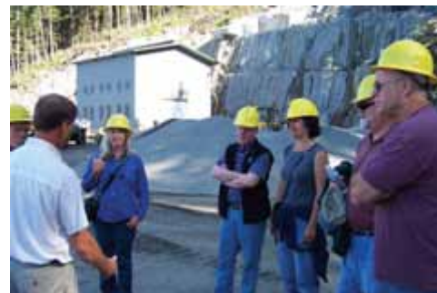
Juneau Delegation visits Lake Dorothy Hydro

Emerging Technology Fund: provides grants for testing energy technologies in Alaska.